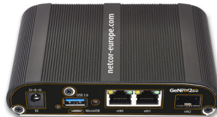
GeNiJack 201 with two RJ45 ports and one SFP port