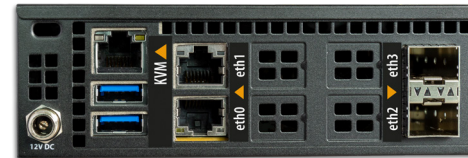
GeNiJack 401 with two RJ45 ports and two SFP ports