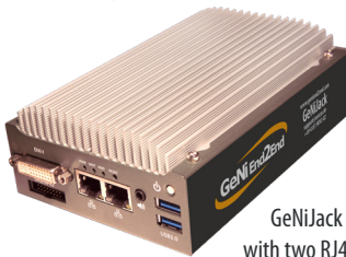
GeNiJack 301 with two RJ45 ports

GeNiJack 201, GeNiJack 301 and GeNiJack 401 are new integrated GeNiEnd2End Hardware Endpoints for NETCOR's GeNiEnd2End 24/7 end-to-end service monitoring software. It is very easy to deploy the GeNiJacks into the network to deliver End-to-End active performance monitoring and analysis of Triple Play network traffic. Under the control of the web based GeNiEnd2End network management and reporting solution the GeNiJacks monitor permanently the QoS and QoE performance metrics of Triple Play applications. In case predefined thresholds are exceeded, an alarm is generated for early problem detection.