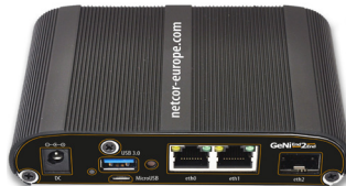
GeNiJack 201 with two RJ45 ports and one SFP port