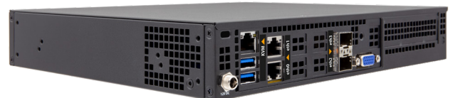
GeNiJack 401 with two RJ45 ports and two SFP ports