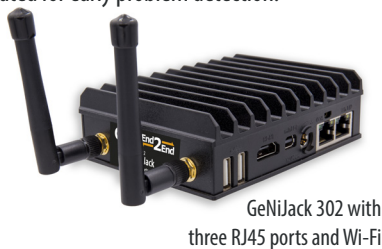
GeNiJack 302 with three RJ45 ports and Wi-Fi

GeNiJack 201, GeNiJack 302 and GeNiJack 401 are new integrated GeNiEnd2End Hardware Endpoints for NETCOR's GeNiEnd2End 24/7 end-to-end service monitoring software. It is very easy to deploy the GeNiJacks into the network to deliver End-to-End active performance monitoring and analysis of Triple Play network traffic. Under the control of the web based GeNiEnd2End network management and reporting solution the GeNiJacks monitor permanently the QoS and QoE performance metrics of Triple Play applications. In case predefined thresholds are exceeded, an alarm is generated for early problem detection.