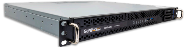
GeNiJack 402 with two 10G Fiber SFP cages